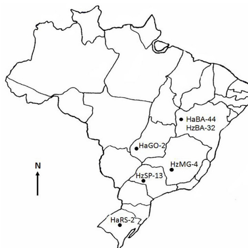
Figure 1. Distribution of Helicoverpa armigera (HaBA-44, HaGO-2, and HaRS-2) and H. zea (HZMG-4, HZSP-13, and HZBA-32) populations sampled in Brazil.